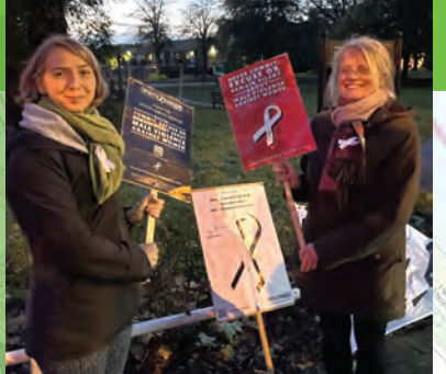
Campaigned against violence towards women and girls on the White Ribbon Walk

Planted bulbs, created beds and cleared Chertsey Court Garden with residents in Big Green Week.