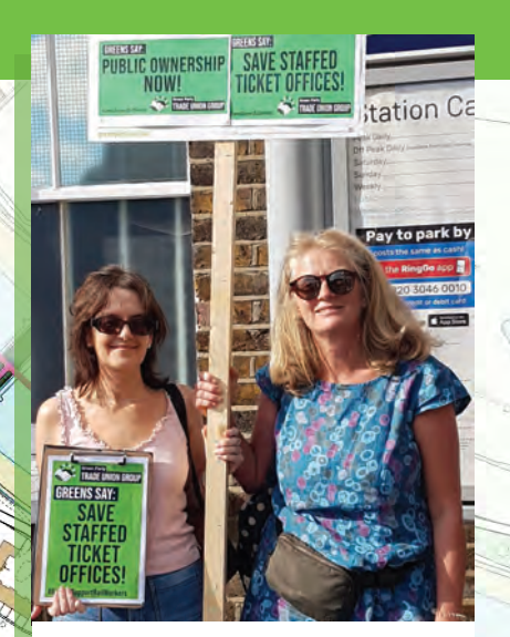
Campaigned against the closure of Mortlake ticket office.

Planted bulbs, created beds and cleared Chertsey Court Garden with residents in Big Green Week.