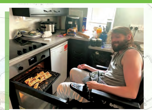
Sorted out disabilities grant to get long-awaited kitchen and garden adaptations for wheelchair user.

Helped secure improved CCTV, a full ward police team and street lighting to improve residents' safety.