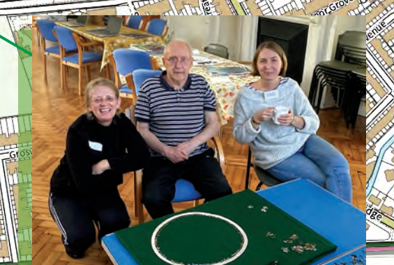
Weekly volunteer at Mortlake Community Association, community cafe and advice hub. Pushed Housing Association to get rid of rats in tenants' home and lobbied Council to improve pest control across the borough.