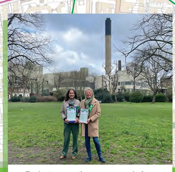
Took strong action on proposals for STAG Brewery and Barnes Hospital in council and community meetings ensuring residents concerns are heard.

Initiated a petition for an updated transport strategy in our area and campaigned for improvements to walking and cycling routes and public transport infrastructure.