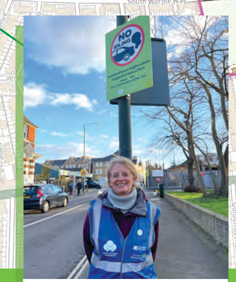
Took action to stop engine idling to clean up air at two level crossings.